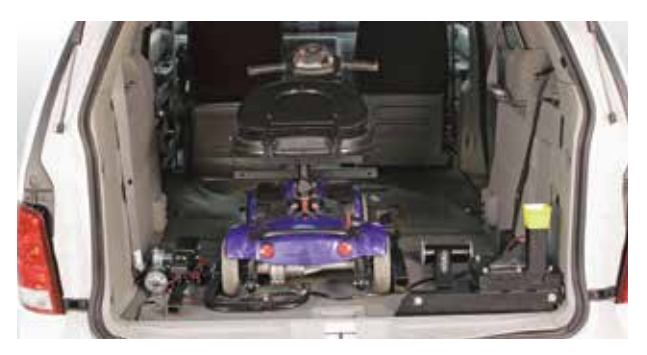
Take-apart lift disassembles when not in use if desired.