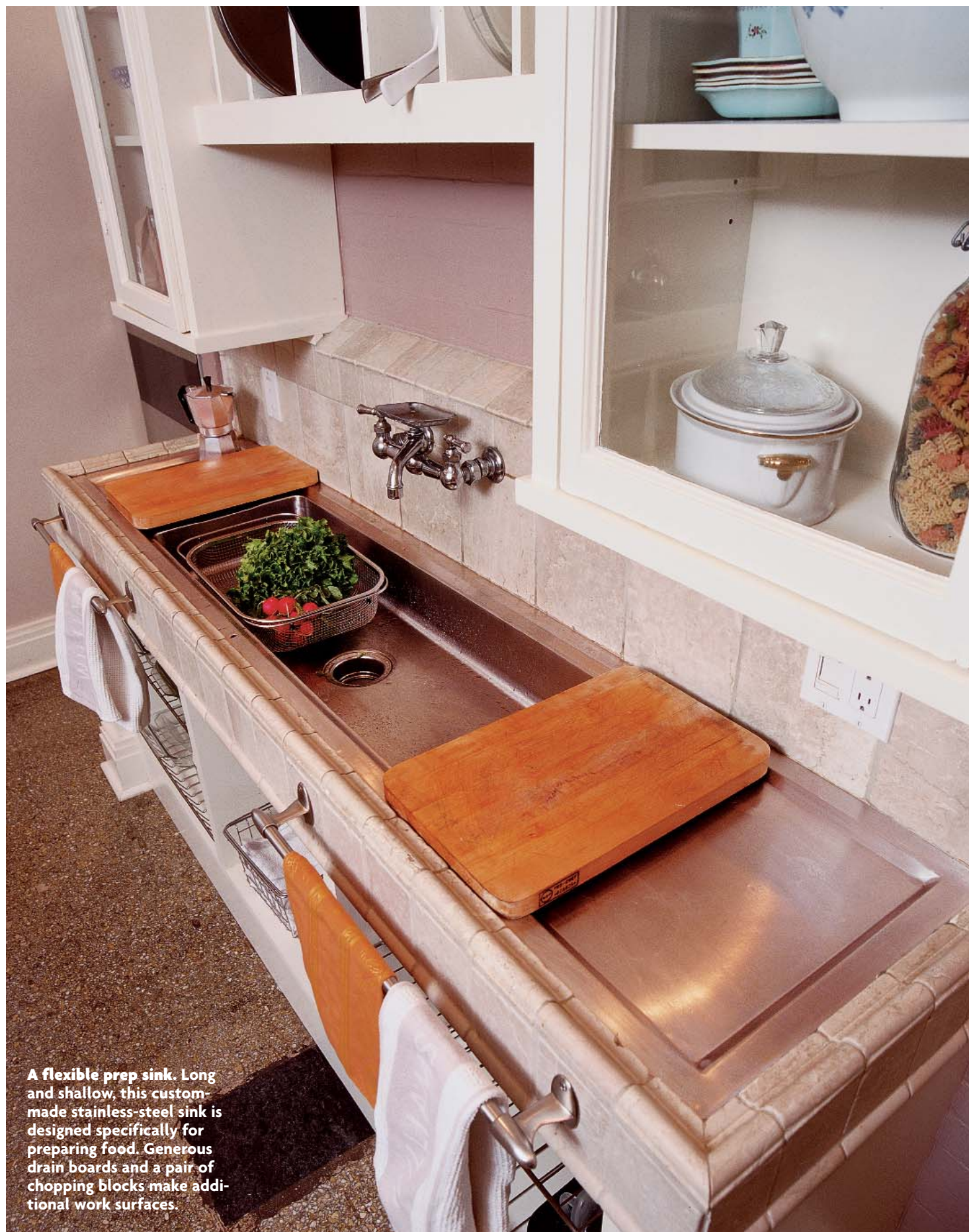
A flexible prep sink. Long and shallow, this custom-made stainless-steel sink is designed specifically for preparing food. Generous drain boards and a pair of chopping blocks make additional work surfaces.