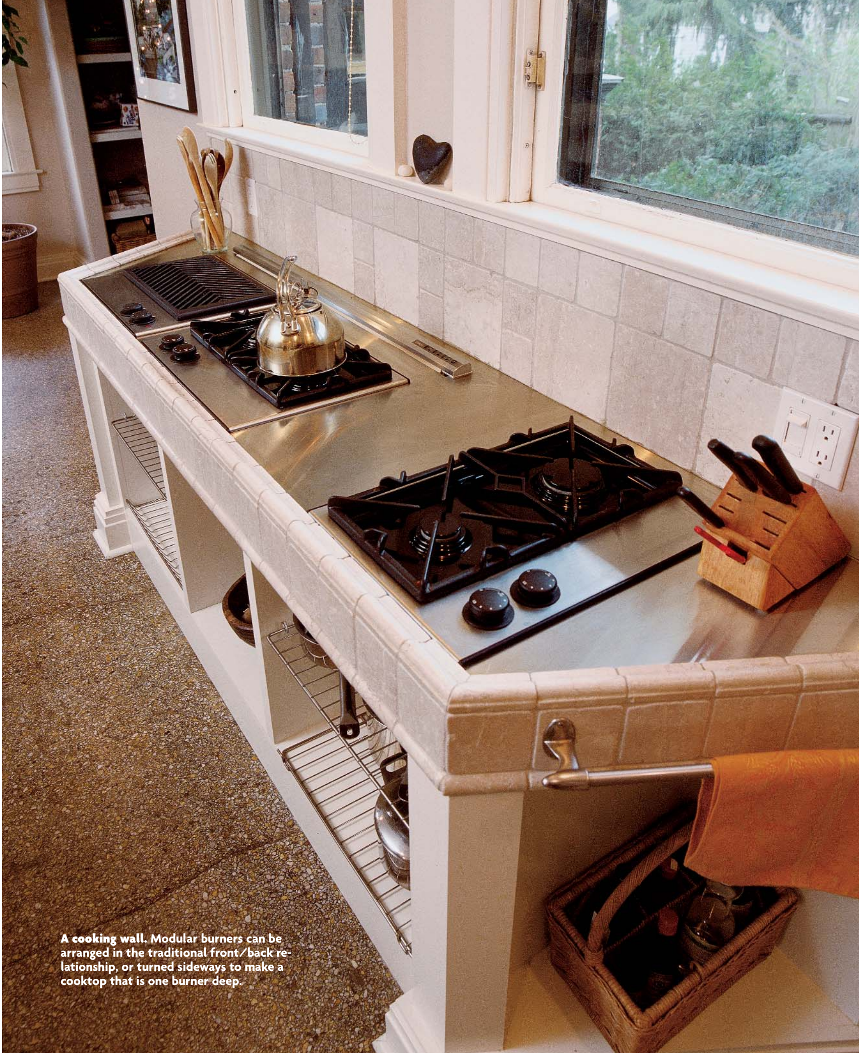
A cooking wall. Modular burners can be arranged in the traditional front/back relationship, or turned sideways to make a cooktop that is one burner deep.