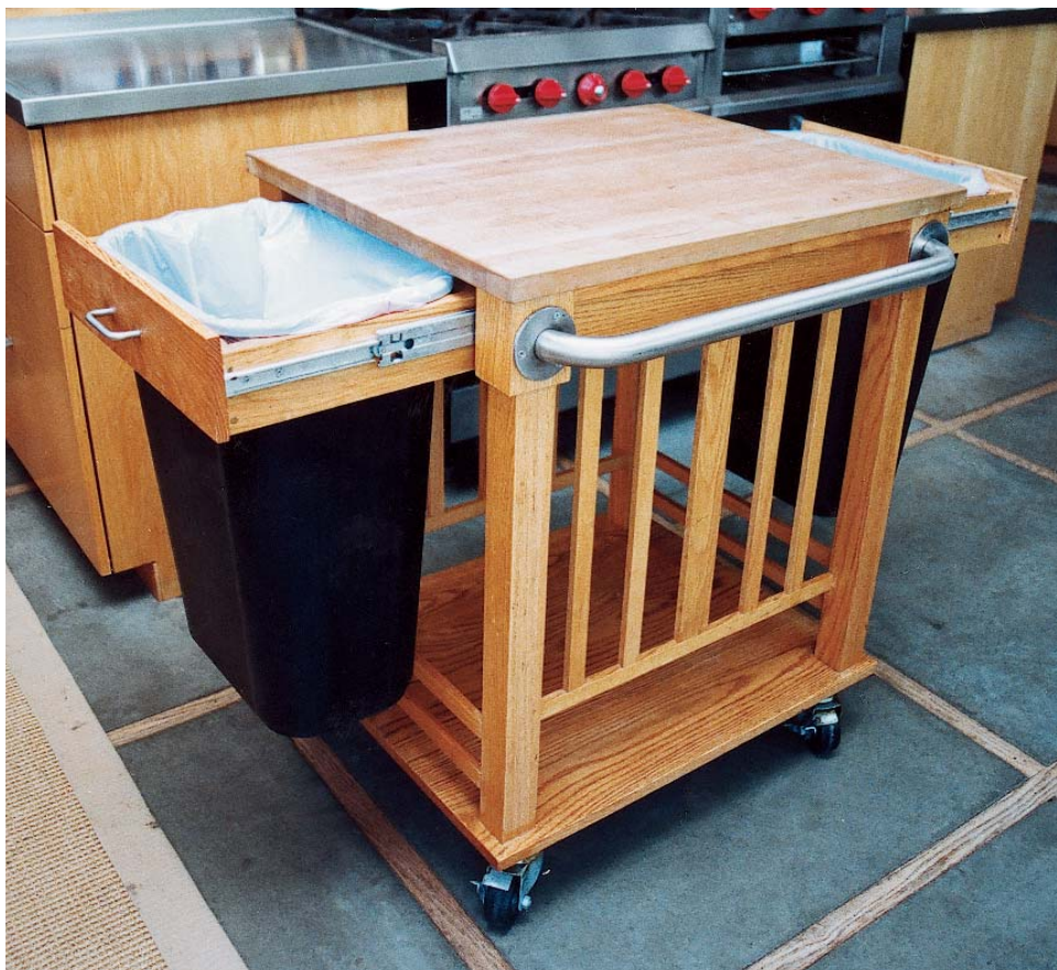
Carts provide storage and work surface. A rolling workstation such as this one can expand counter space as needed or act as a truck to ferry heavy, hot pots from one part of the kitchen to another. This cart is outfitted with trash bins on heavy-duty drawer pulls at each end.