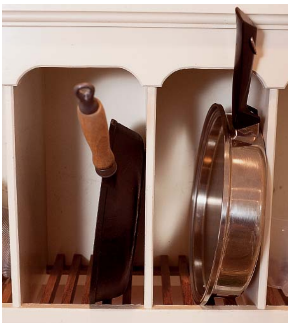
Pots and pans at the ready. Above the prep sink, a pot rack is purposefully positioned to let freshly washed cookware drain harmlessly into the sink. Pans rest on teak slats in their own cubby holes.