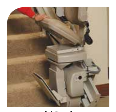
Power folding footrest automatically flips up/down when seat is raised/lowered.