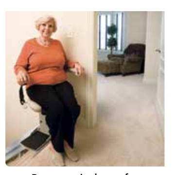
Power swivel seat for effortless exit. Controlled on chair arm or wireless call/send.