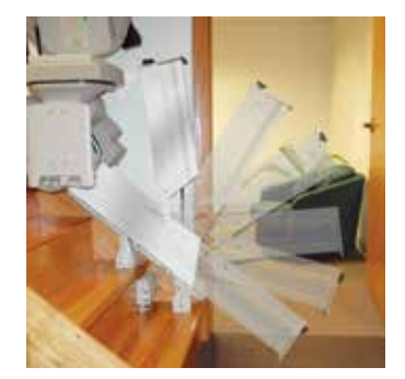
Power or manual folding rails for narrow hallway or when doorway is at the bottom of stairs. Manual operation or push button automatic.