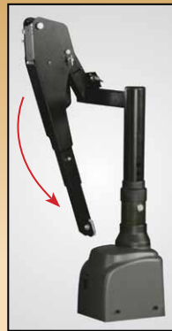
Optional Fold-Down Lift Head (requires quick release t-pins)