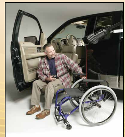
Valet Seat with Out-Rider Lift