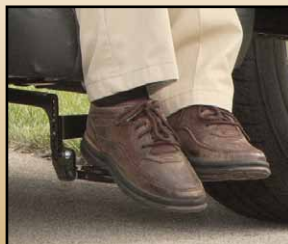
Valet Shown with optional footrest