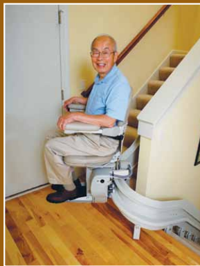
CUSTOM CURVED RAIL STAIRLIFT