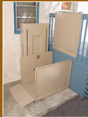
VERTICAL PLATFORM LIFT