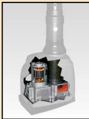
Direct Gear Drive Technology – absence of chains means no slipping and virtually maintenance-free operation.

The exterior version of the world's most popular vehicle lift gives you unsurpassed versatility for loading and unloading mobility devices at the rear corner of the truck bed!