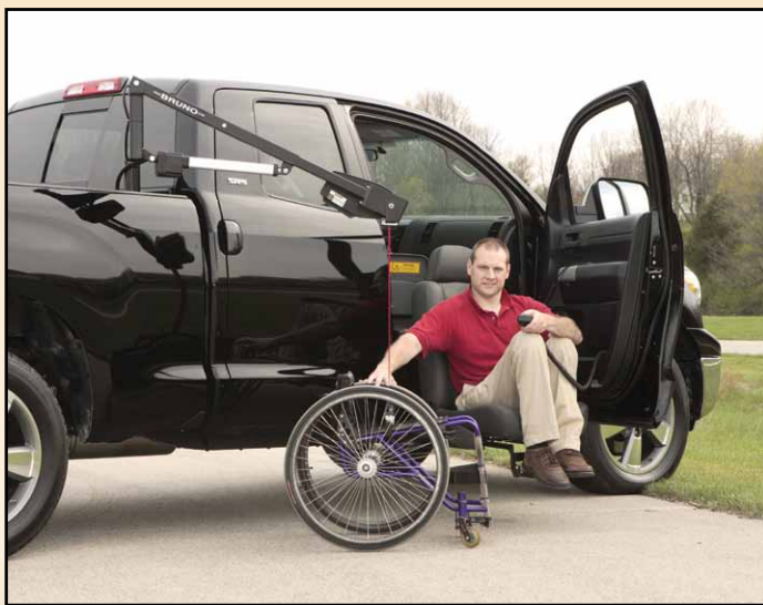
Out-Rider with Valet Seat