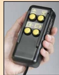
Optional Exterior Pendant Package