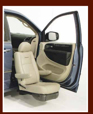
VALET<sup>™</sup> SIGNATURE SEATING -VALET<sup>™</sup> PLUS

BRUNO INDEPENDENT LIVING AIDS, INC. <sup>®</sup> 1780 Executive Drive, P.O. Box 84, Oconomowoc, WI 53066 www.bruno.com