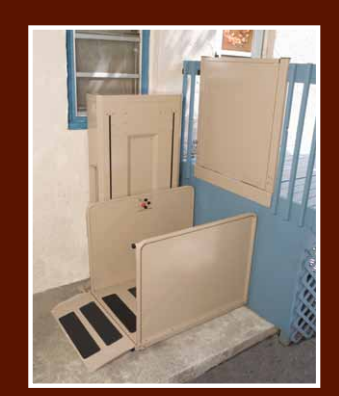
VERTICAL PLATFORM LIFT