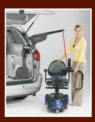
CURB-SIDER® VEHICLE LIFT