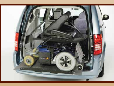
Front-Wheel/Rear-Wheel Drive Powerchairs