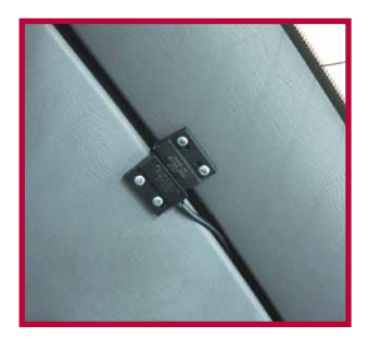
Door Safety Switch