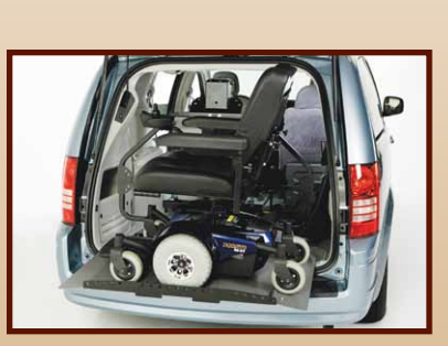
Mid-Wheel Drive Powerchairs