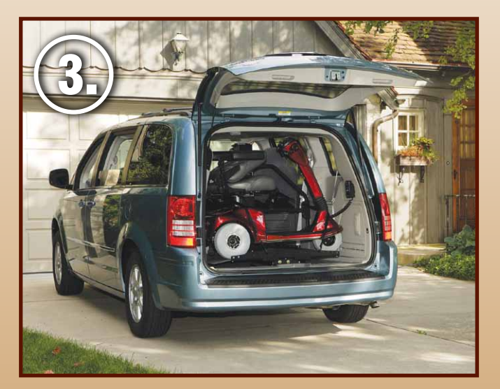
Power platform into the vehicle.