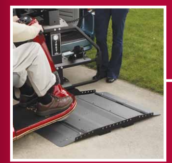
Easy Drive On/Drive Off Platform From Either Side