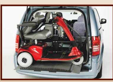
Three or Four Wheeled Scooters