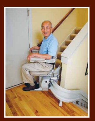
CUSTOM CURVED RAIL STAIRLIFT