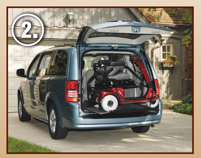
Raise platform and secure the belts...