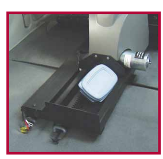
Obstruction Sensing Safety Plate