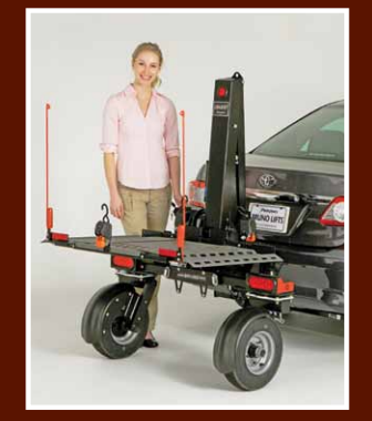
CHARIOT<sup>™</sup> VEHICLE LIFT