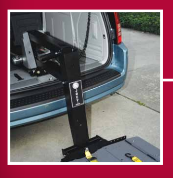
Vehicle Specific Mounting Kits