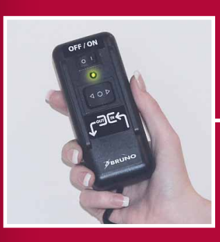
Hand-Held Pendant with Indicator Light