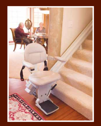
ELITE STRAIGHT RAIL STAIRLIFT