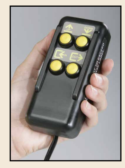
Optional Exterior Pendant Package (VSL-6000)