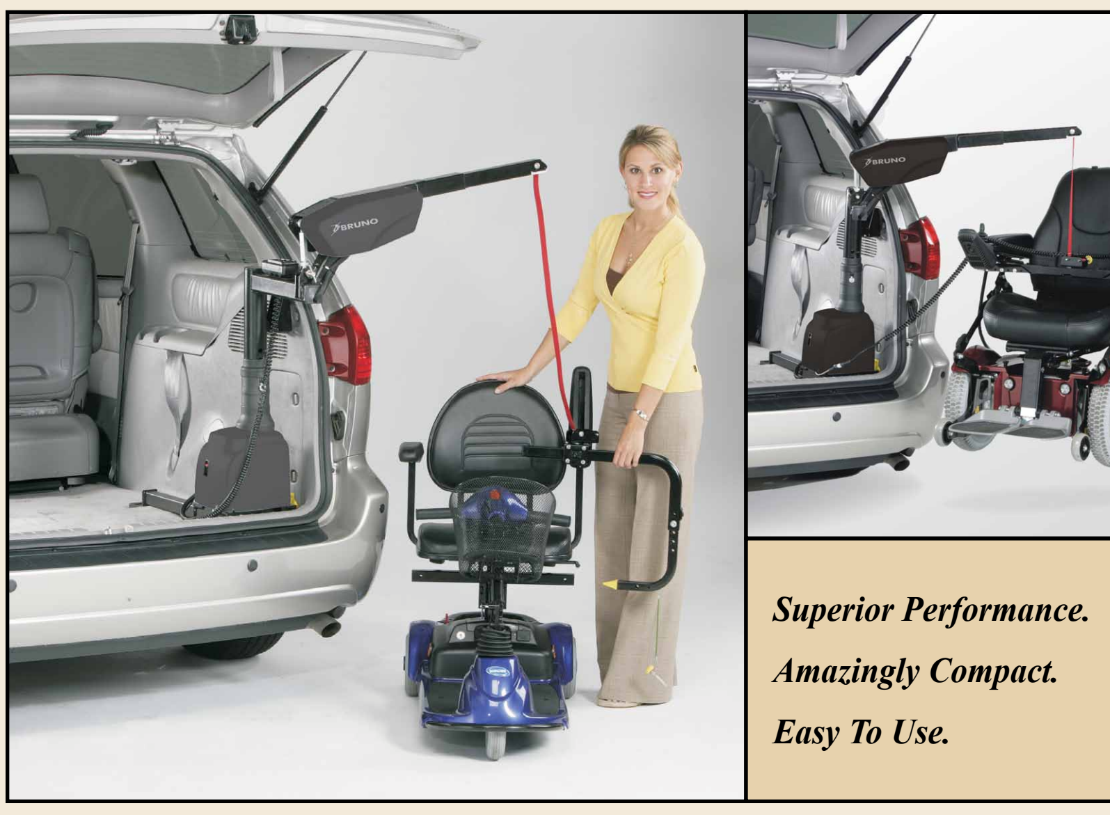
Curb-Sider® Vehicle Lift