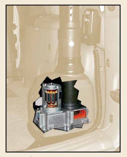
Direct Gear Drive Technology – absence of chains means no slipping and virtually maintenance-free operation.