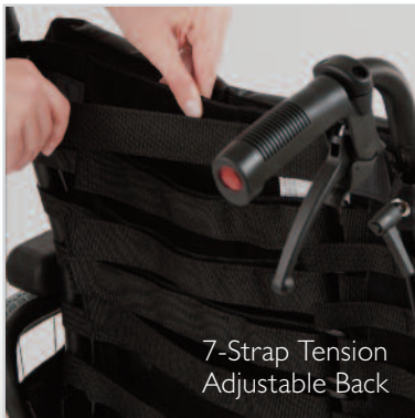
7-Strap Tension Adjustable Back